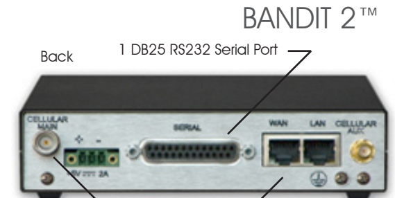
BANDIT 2™ Back 1 DB25 RS232 Serial Port 1 Optional Wireless Cellular 2 10/100 Base TX Ethernet Ports